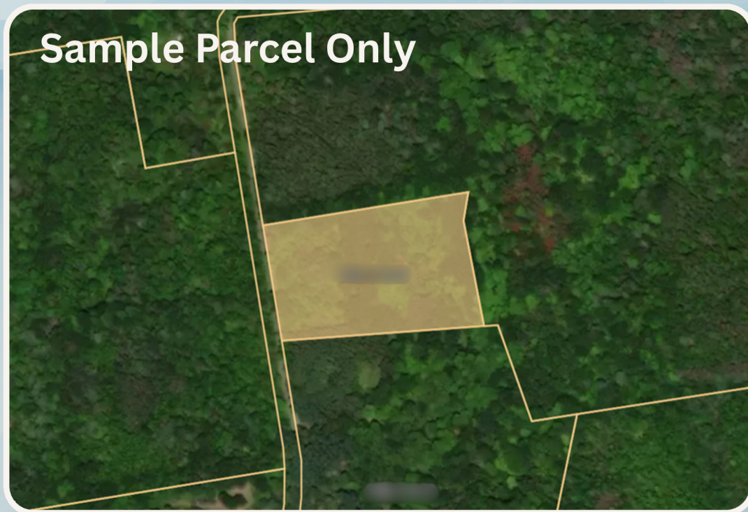
Map 1. Parcel Outline on Satellite Base Map

Disclaimer: All information in this report has been obtained from public sources and is believed to be accurate but is not guaranteed. Buyers are responsible for verifying all facts, regulations, and property conditions with the appropriate county and state offices before purchase.